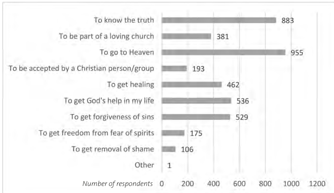
Chart 1: “Why did you want to become a Christian?”