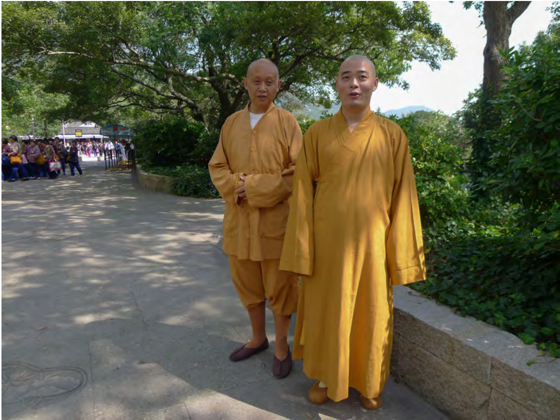
Buddhist monks in China.

asteries and 13 “Buddhist seminaries” (academies) in 15 provincial-level administrative units of China in 2007, 2009, 2010, 2012/2013 and 2019.