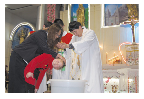
A Baptism in China – Easter 2012.

According to a report of the Faith Institute for Cultural Studies in Shijiazhuang, which annually collects relevant data and publishes it in the newspaper Xinde ( Faith ), this past Easter 22,104 baptisms were performed in 101 different dioceses. More than 75% of those baptized were adults. Many other baptisms occur as well, however, at different times of the year, and those have not yet been integrated into the statistics. In addition, by the reporting deadline of April 19, a number of communities had not yet submitted their reports. The figures for the individual cities and provinces respectively appear as follows: Beijing 500;