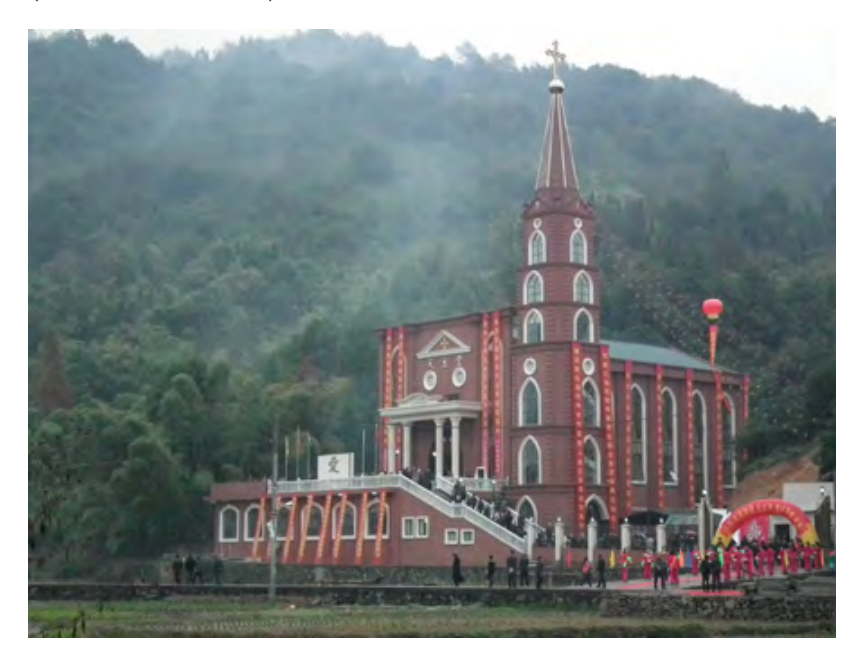
Built for growth: the church in Luoxi, Yonglin Parish.

Wenzhou (ZJ) , Yongjia Deanery, Yonglin Parish, Luoxi: Dedication of a new church in honor of Our Lady of the Immaculate Conception. The church, lying at the foot of a mountain and built in the gothic style, has a surface area of 1,600 m2 and cost 5 million Yuan to build. Originally, there was only one Catholic family in Luoxi. Now there are 33 Catholic families. The small community first met for prayer in a private house, but that soon became too small for the quickly growing and mostly young community. Only a few weeks after the celebration of the dedication, 22 persons were baptized in the new church ( xdo Dec. 3 and 25).