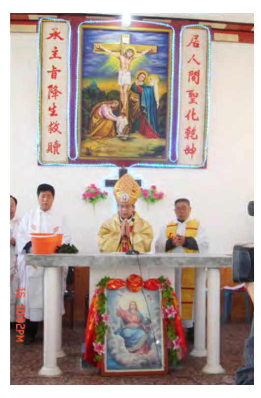
Modest: the village church in Nanzhidaohui.

Wenzhou (ZJ), Nanxi Parish, Bilian Sub-parish: Dedication of the new St. Lawrence Church. The three-story "gothic" church, with its two 37 meter high towers, contains a multi-functional hall on the ground floor. On the 1st floor there are rooms of various sizes for group activities and on the 2nd floor there is the church itself, with room for 400 persons. The complex cost 2.4 million Yuan. The village's first little church dated back to 1896. It was enlarged various times over the years and then restored after the Cultural Revolution. The authorities decided it was too dilapidated in 2008. In any case, it had become too small for the growing community ( xdo Jan. 16).