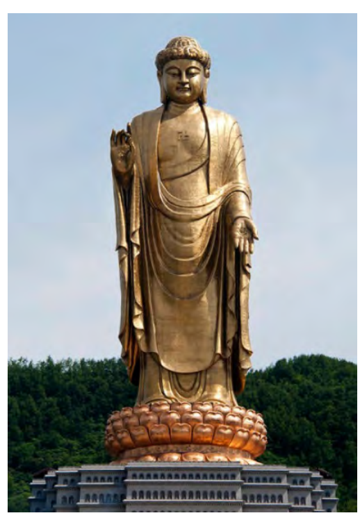
The Buddha statue of Lushan is placed on top of a Buddhist monastery and including the pedestals it has a total height of 208 meters.

According to a story in the South China Morning Post (SCMP), tourism bureaus and real estate developers have been engaged in a race to build ever-higher Buddha statues following the success of the Lingshan Grand Buddha, completed in 1996. The colossal Buddha (88 meter high) attracted 3.8 million visitors in 2013 and brought in more than 1.2 billion yuan in revenue from tourists. Competition in the Buddha construction business is tough. According to the Guangzhou Xin Zhoukan (New Weekly), the Nanjing firm Aerosun (Hangtian chenguang 航天晨光) is the leader in the field. The firm plans 10 such projects throughout all of China for 2014, and it has already built giant Buddhas in many Asian countries and in the U.S.A. The firm's largest Buddha to date is the 108 meter high Guanyin Buddha of Sanya (Hainan). A representative of the firm said that while in countries such as Japan, Thailand or Bhutan the faithful contribute to the building of Buddha statues out of a genuine sense of religious piety, in China the building of such statues is motivated much more by touristic aspects and competition for the tourist dollar. According to the SCMP, there are often tensions between the Bud-