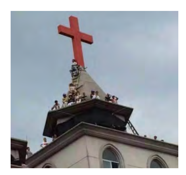
Christians in Wuxing, Huzhou City, clamber onto the roof of their church in order to protect the cross.

During July and August of 2015 the number of crosses removed from steeples and roofs of both Protestant and Catholic churches in the Province of Zhejiang took a drastic upturn. According to a number of sources, the removals were to have been completed within a certain time period (there was talk of a time limit of two months or until the end of August). Already by the middle of July, sources said that more than 1,200 churches in the province had been affected by the campaign. Many congregations attempted to mount some resistance: some kept watch over their churches, others blockaded access, still others wrote letters of protest or sought legal representation. Some simply put up a new cross as soon as the old one was torn down. The whole situation led to clashes with the cross removal teams and with the security