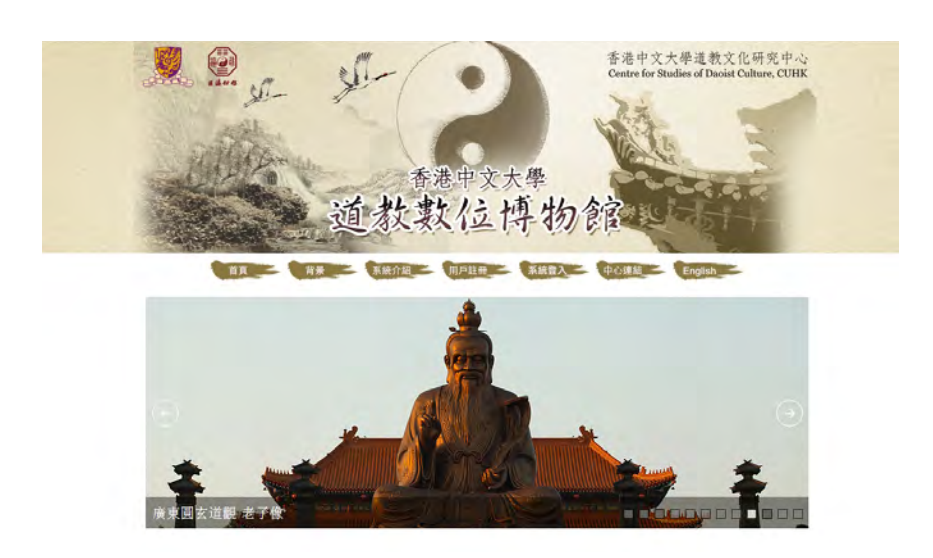
Portal of the "Daoist Digital Museum."

been already completed and the digital version of the sources has been uploaded in the Museum and includes use of GIS (Geographic Information System) technology. The collected material should make possible better research into Daoism in the region. The URL (internet address) of the digital museum is as follows: http://dao.crs.cuhk.edu.hk/digitalmuseum/CH.