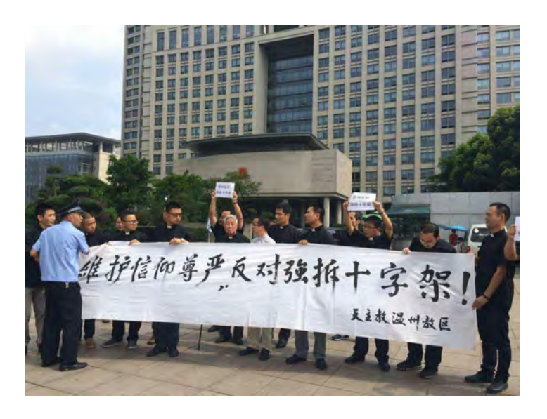
Bishop Vincent Zhu Weifang and priests belonging to the official section of the Diocese of Wenzhou demonstrate on July 24 before the government offices of the City of Wenzhou.

On July 28, the priests of the official section of the diocese led by Bishop Zhu Weifang published an open letter and on July 29, the priests of the underground section of the diocese led by Coadjutor Bishop Shao Zhumin published their own open letter, in which they all used sharp language to protest against the removal of the crosses. A total of 50 clerics signed their names to the letters.