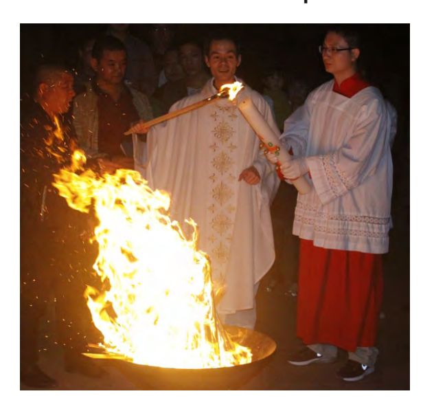
2015 Easter Vigil in the parish of Longgang, Diocese of Wenzhou.

For the eighth time since 2007, the Faith Institute for Cultural Studies (Shijiazhuang) has compiled statistics on Easter baptisms in mainland China. For the first time the Faith Institute has collaborated with the Chinese Catholic Research Centre (Zhongguo tianzhujiao yanjiushi 中国天主教研究室), which is under the Catholic Patriotic Association and the official Bishops' Conference. The statistic, published in the Catholic weekly newspaper Xinde (Faith), shows the numbers of newly baptized at Easter of 2015 and indicates that number as 19,554. This is a slight decrease of about 500 from the total number of 20,004 baptisms registered in 2014. The dioceses in Hebei Province are still in first place in terms of absolute figures – 3,368 baptisms – but there were about 600 fewer newly baptized this year than last year. The dioceses of