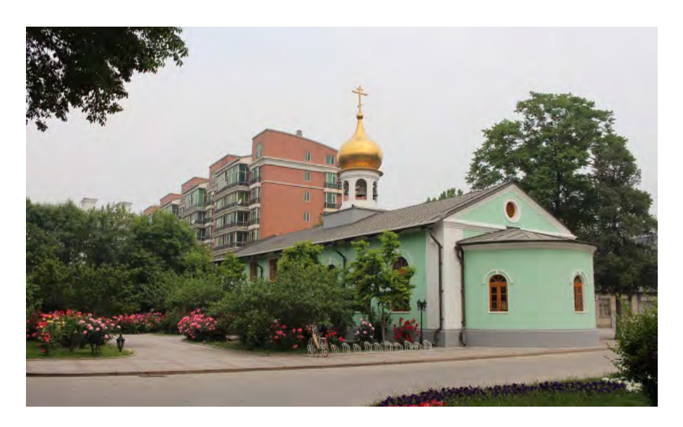
On May 17, Metropolitan Hilarion celebrated the Divine Liturgy in the Church of the Dormition, which stands in the grounds of the Russian Embassy in Beijing.

prochement with the Russian Orthodox Church is seen in conjunction with the fact that the Chinese government is beginning to better understand just what political influence Orthodoxy wields in Russia. The recent encounter between Patriarch Kirill and President Xi Jinping is part of this development (see entry above of May 8, 2015). The Russian side will also be using this theme to improve its relations with its eastern neighbors in these times when there seems to be a "second Cold War" developing. Thus, the three sides – the Moscow Patriarchate, the Russian and the Chinese governments – all emphasize the political dimension of this theme and hope that the religious question might have a positive influence on Sino-Russian relations ( AsiaNews May 19). – For background on this item, see: China heute 2014, No. 4, pp. 208-210 (in German).