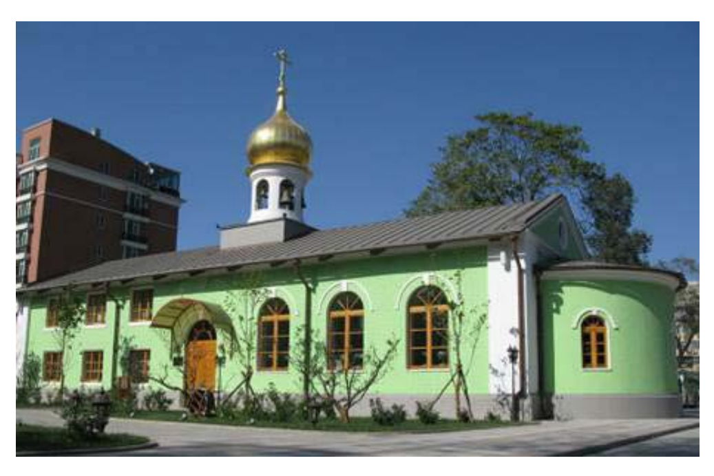
The Dormition Church on the territory of the Russian embassy in Beijing was restored in 2009.

2008, Expo in 2010 and the ROC clergy's service for Orthodox compatriots in surviving Orthodox churches in China.