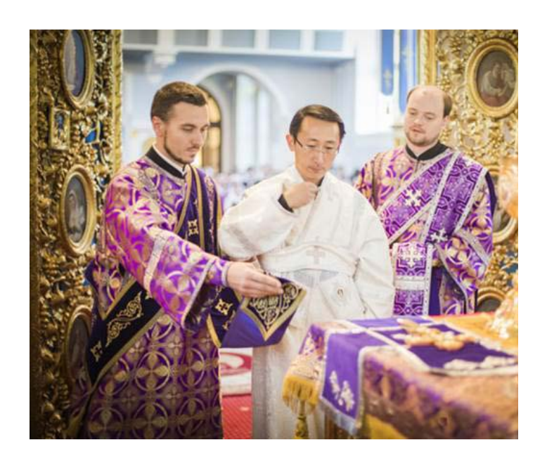
The Chinese side nominated two Orthodox citizens of the PRC to study in Russia. In September 2014, the student who was trained in St. Petersburg was ordained deacon. Soon he will become the first ordained priest of the Chinese Church after the Cultural Revolution.

of a bishop. I hope that the Chinese Orthodox bishop, who will be elected by the Chinese faithful and approved by the PRC state authorities as head of the Chinese Orthodox Church, will govern their work, cooperate with the authorities and maintain contacts with other religious communities, including developing relations with the Russian Orthodox Church.