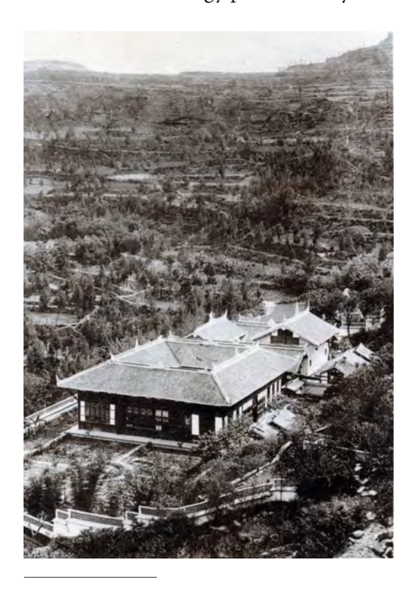
Xishan 西山, 1932.

This, of course, was based on the ground of a clear consciousness, namely that, for a monastery, the first duty for being a part of the body of the Church is to be faithful to its nature, the same nature in China as elsewhere. There is no monastic life without genuine fraternal life and communal liturgical prayer. But the main issues and tensions at stake in this process of adaptation to the Chinese context were many and different, such as the architecture of the new-built monastery, the formation given to Chinese postulants and novices and the liturgy performed by the community. Let us consider these issues briefly.