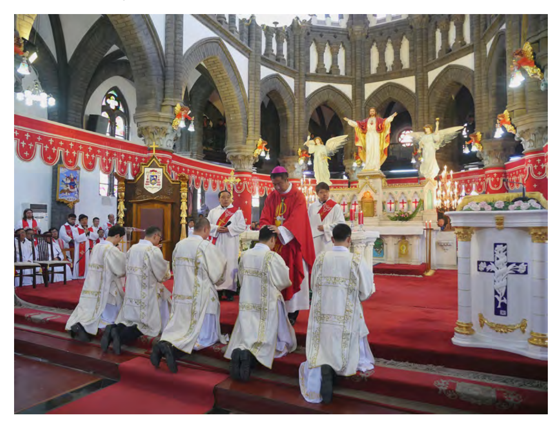
Priestly ordination in the Cathedral of Shenyang, November 2017.

Why the number of priestly ordinations is so much higher than in other years is not clear; one reason could be (as appears from the reports) that in 2017 a number of men were ordained who had to interrupt their studies when the major seminary in Shanghai was closed in 2012 and had to finish them elsewhere. Overall the number of priestly vocations is decreasing.