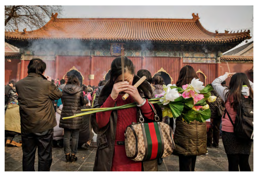
Incense offerings at the Buddhist Lama Temple in Beijing.