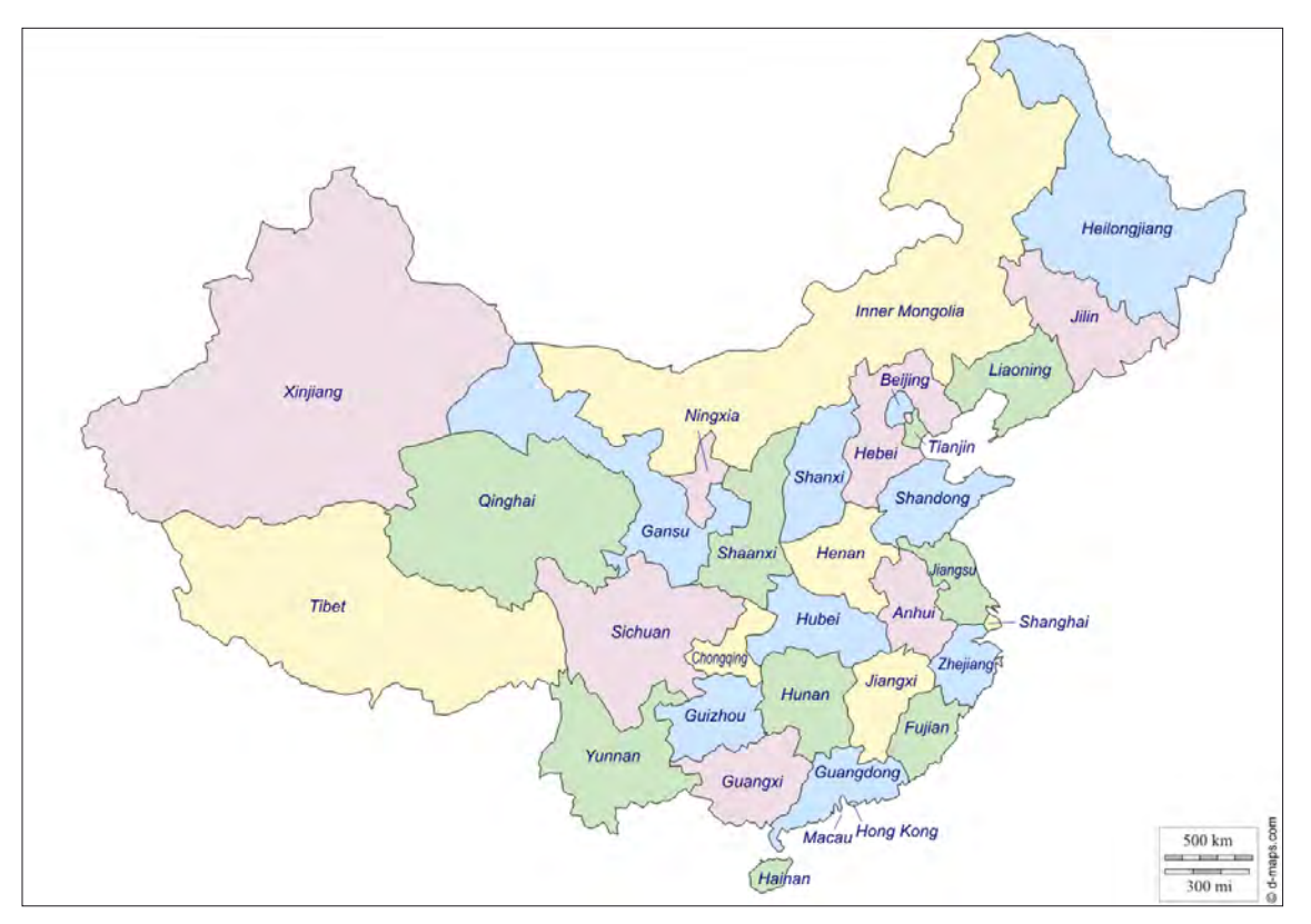
Map: d-maps.com/carte.php?num car=27749&lang=de