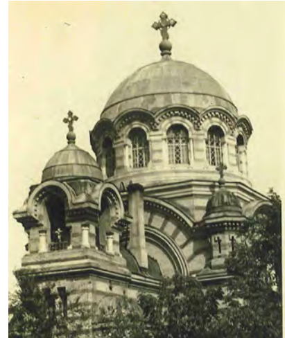
The Pokrov Church in Harbin.

For more on the Pokrov Church and on other Orthodox churches in Harbin see the contribution of Piotr Adamek in China heute 2018, No. 2, pp. 118-121 [in German].